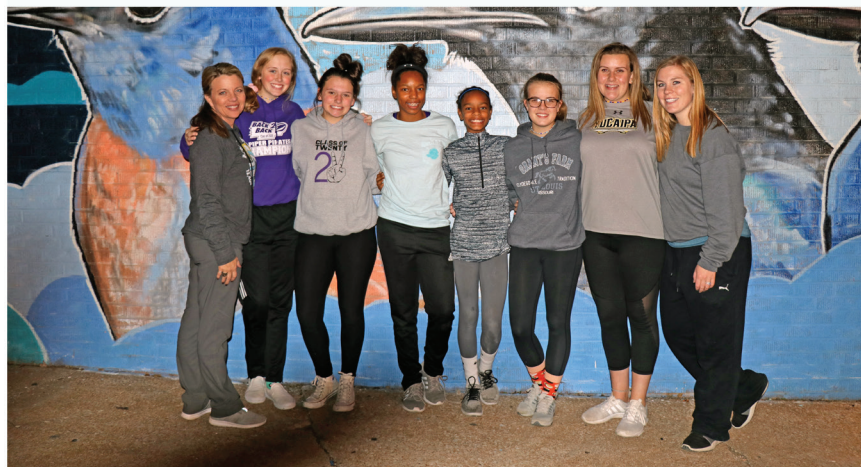
One of the WFC teams after a day of serving at Shelter KC

The way Shelter KC partners with the local church to bless the city is unlike any organization I have ever seen. Our church is blessed to have a partner like Shelter KC where we serve Kansas City in such a practical and meaningful way.