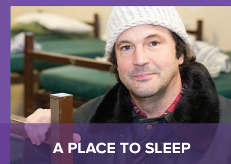
A PLACE TO SLEEP