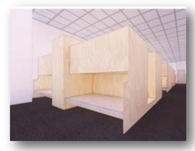
New Modern Step-up Beds used in Dorms

Shelter Launch is a program for guests staying in our emergency overnight shelter. After their first two weeks of housing, guests are encouraged to join the Shelter Launch program.