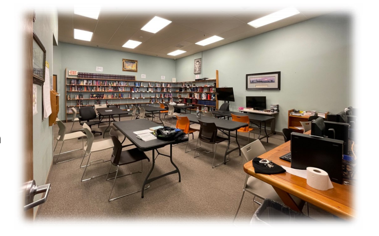
Current Library and Future Dorm